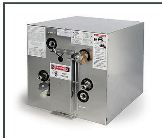
6 GAL Front Mount, 120V, Front Heat Exchange 11811