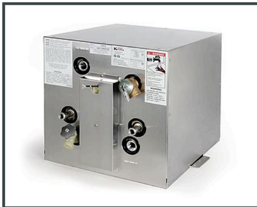
6 GAL Side Mount, 120V, Front Heat Exchange 11810