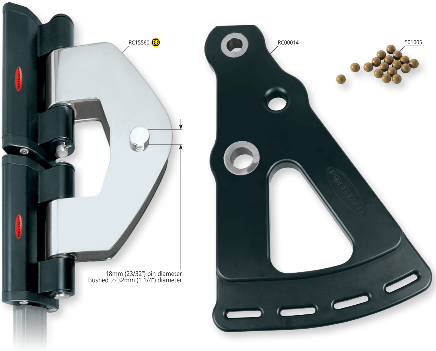
18mm (23/32") pin diameter Bushed to 32mm (1 1/4") diameter